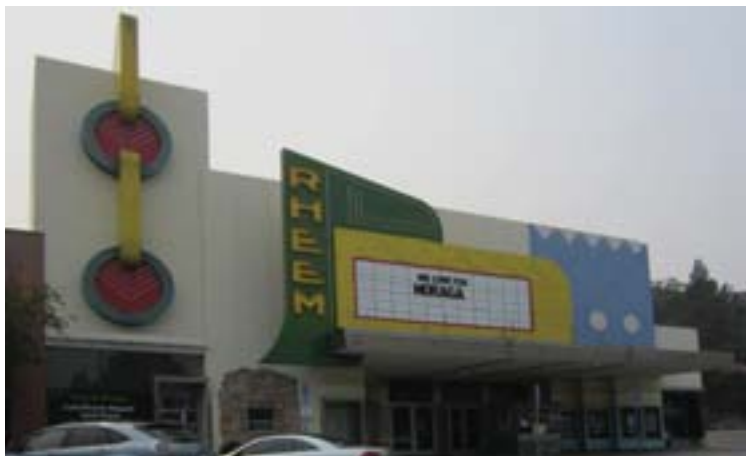
Rheem Theatre's message to the town.